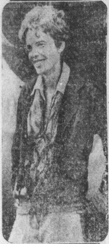
Mrs. Amelia Earhart Putnam is shown at Newark, N. J., airport after she had flown non-stop from Los Angeles in 19 hours and five minutes. She is the first woman to make a non-stop cross country flight.