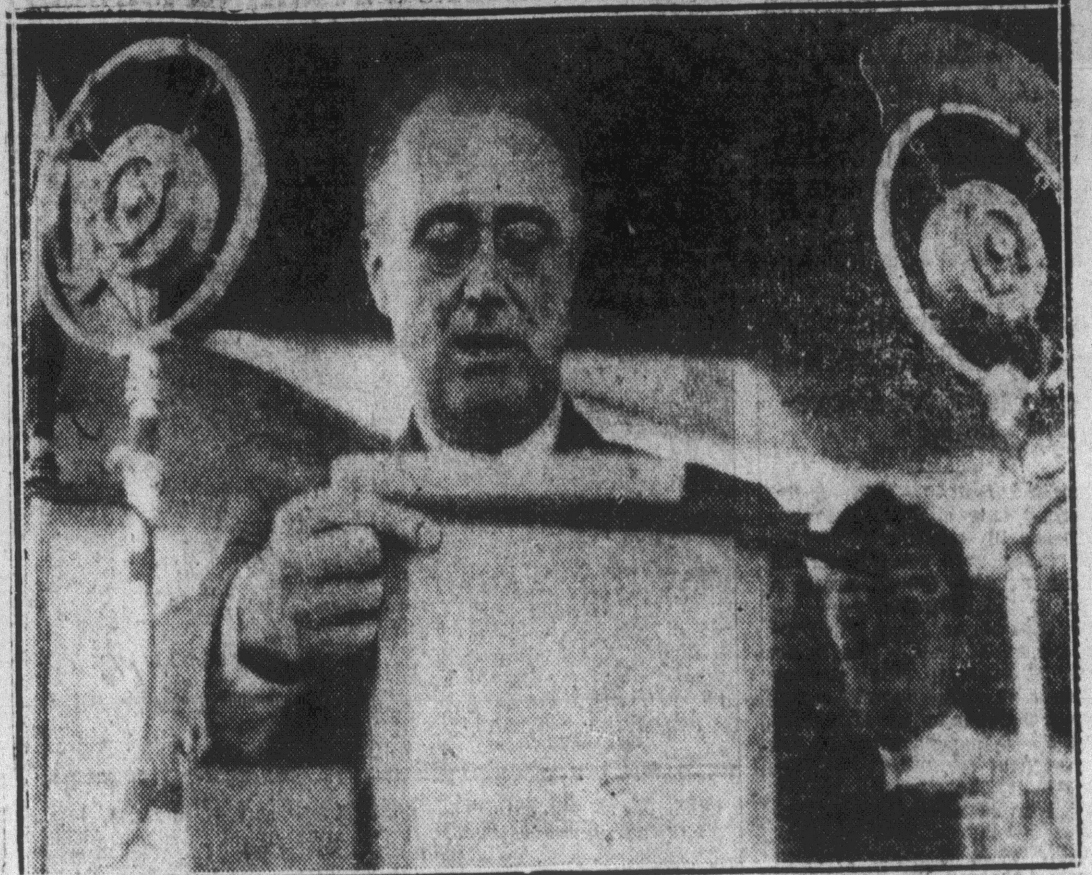
Gov. Franklin D. Roosevelt is shown delivering his second major address in his campaign for the presidency before a crowd estimated at around 200,000 persons at Seagirt, N. J. Prohibition was the subject of his talk.