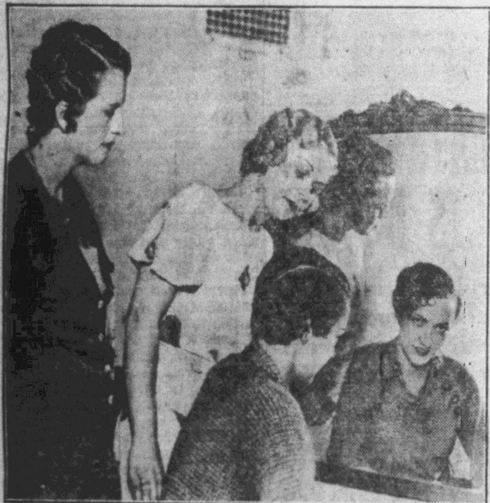
Shifting the "part" from left to right, to accommodate the new style tiny hats, and employment of modernistic angles are two of fashion's decrees for women's hair styles in 1932-33, according to experts at the American Cosmeticians' association convention in Chicago. Here are shown three of the more striking new coiffures.