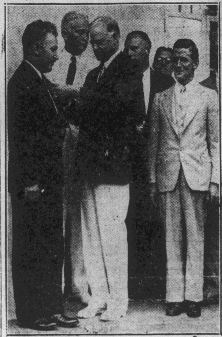
President Hoover, standing on a porch of the executive offices, is pinning a distinguished flying cross on Wiley Post, who last year flew around the world with Harold Gatty in less than nine days. Senator Bingham, president of the National Aeronautical Association, is standing between them. Gatty is at the right of the President.