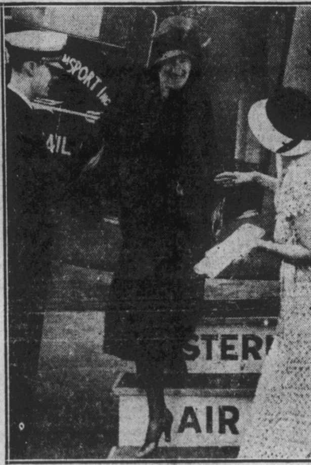
Mrs. Edith Kermit Roosevelt, widow of former President Roosevelt, leaves the plane that took her to Washington for President Hoover's official notification. She is one of President Hoover's ardent supporters and was the center of a buzz of political and social discussion on her old home grounds—the White House lawn.