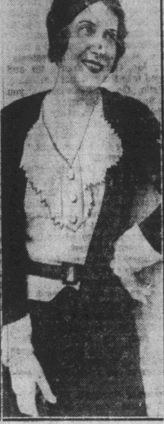
Ruth Chatterton, the actress, refused to comment on a romance linking her with George Brent, actor, when she returned to New York from Europe.