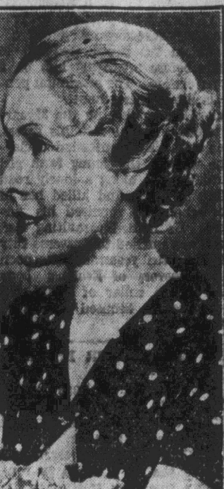
One of the new ultra-modern coiffures, showing the fashionable 'classical' hairdress, is displayed by June Clyde, the movie actress