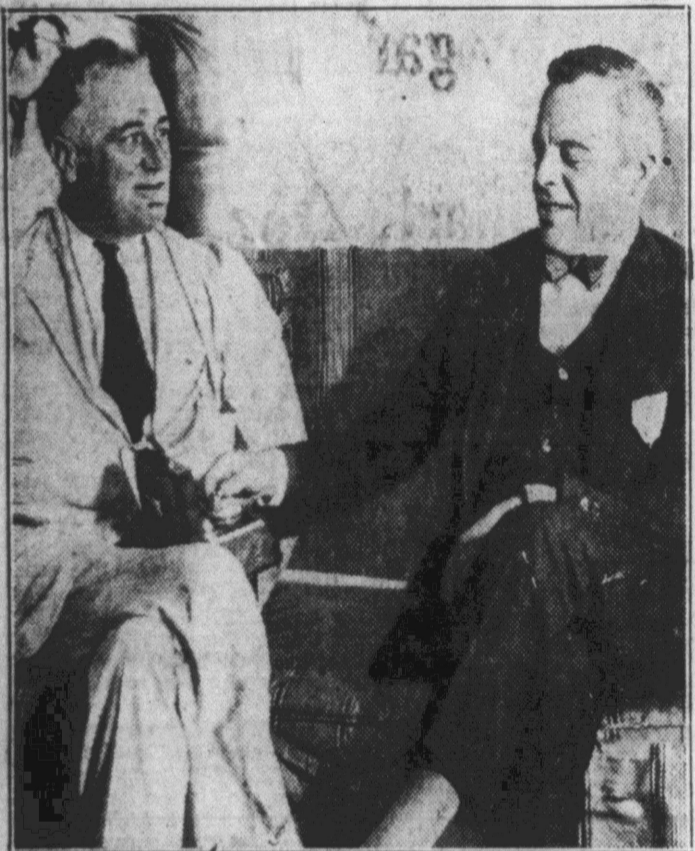
Gov. Joseph B. Ely of Massachusetts, outstanding opponent of Governor Roosevelt's presidential nomination, and Mr. Roosevelt reached an agreement whereby Ely can endorse the nominee and lead the fight for the democratic ticket in the bay state. The two are shown during their conference at the executive mansion in Albany, N. Y.