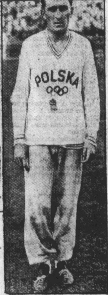
In the international war on track records at Olympic stadium, Los Angeles, Babe Didrikson, America's premier woman star, hurled the javelin 143 feet, four inches, beating the previous record by more than 11 feet. Duncan McNaughton won the high jump for Canada when he cleared the bar at 6 feet 5 3/4 inches. Janusz Kusocinski, Polish distance runner, is shown right after he had won the 10,000 meter run in 30 minutes, 11.4 seconds, beating Paavo Nurmi's mark. Nurmi, who sat in the stands watching the Pole run, formerly held the record of 30:18.8 set in the 1928 Olympics.