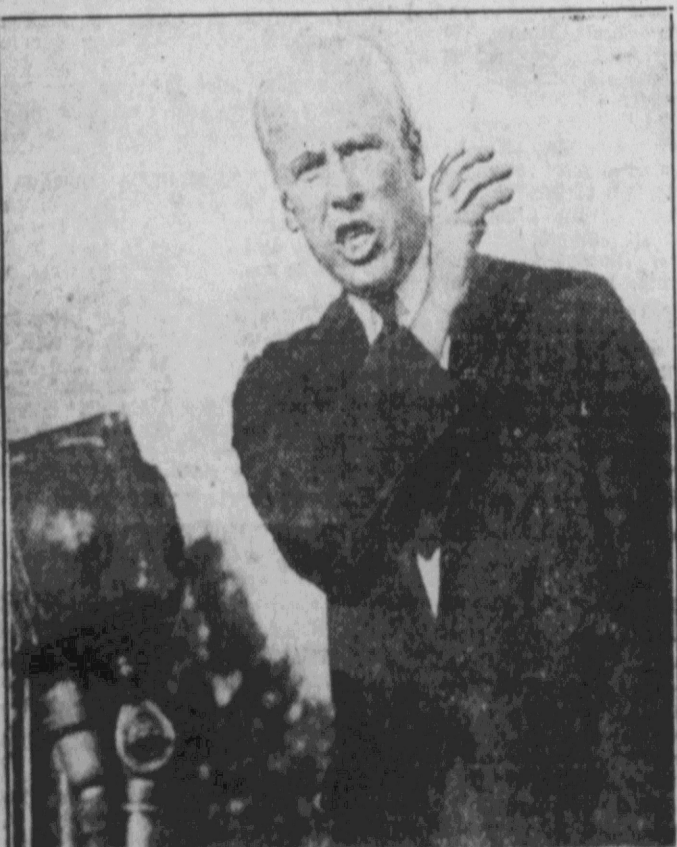
Norman Thomas, socialist candidate for President, opened his party's national campaign with an address in Ulmer park, Brooklyn. He issued a call for repeal, unemployment with a hundred times the vigor and intelligence with which men seek the repeal of the eighteenth amendment.