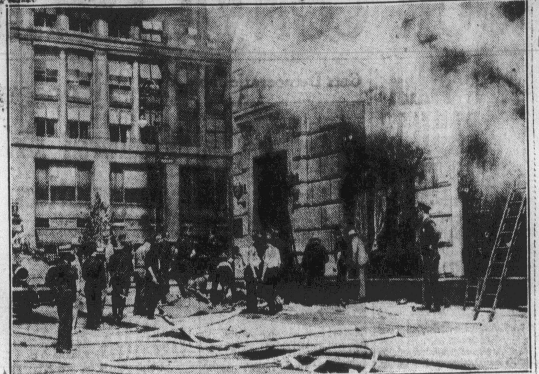
An explosion shook the 42-story Ritz Towers hotel on New York's fashionable Park avenue, killing five firemen and injuring more than 20 persons. The explosion occurred in a paint shop below the street while firemen were fighting a basement fire. The blast smashed the front of a jewelry shop and more than $100,000 in gems were scattered in the street.