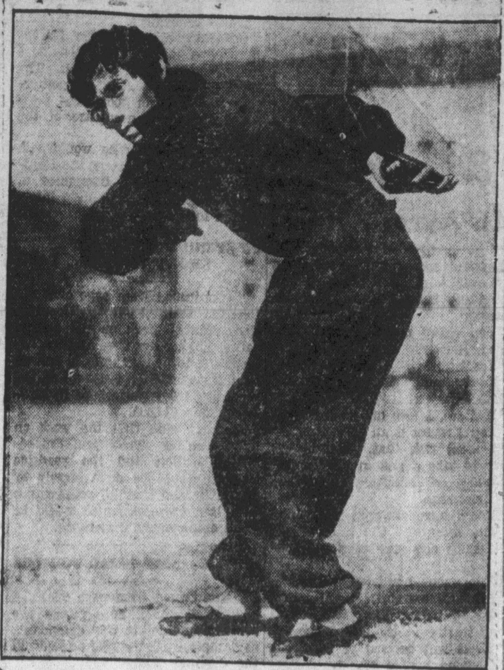
Stella Walsh, the great girl athlete who has decided to compete for her native Poland in the Olympic games, is shown practicing the discus throw, one of several events she has hopes of winning.