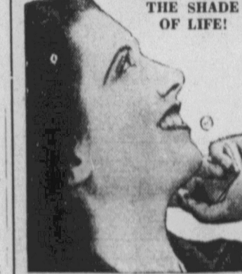
She Confesses the Kind of Love