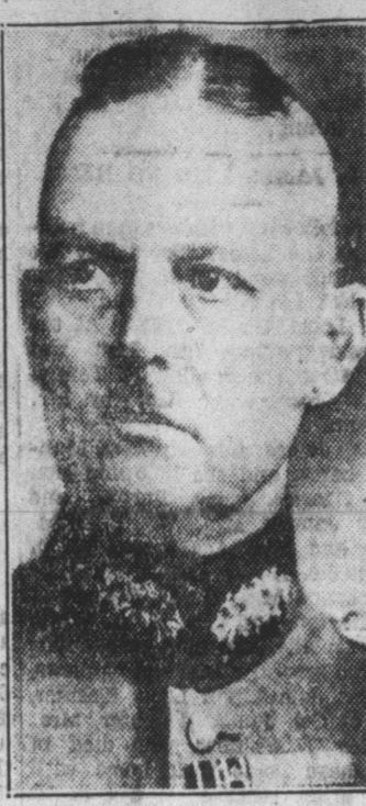
When martial law was proclaimed in Berlin and surrounding province of Brandenburg, Gen. Kurd von Rundstedt was appointed military commander of the area.

in Greenville, Pitt County, North Carolina, the following described real estate, situate in Pactolus Township, to-wit: