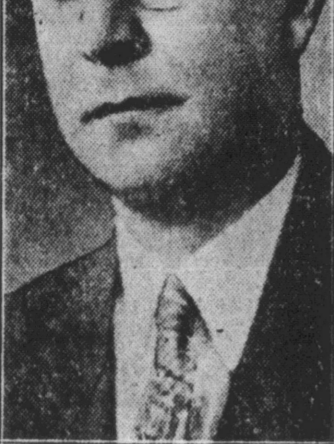
Peter B. Carey, president of the Chicago Board of Trade, led forces opposing the order of three Hoover cabinet members that the board be closed because of alleged discrimination against the Farmers National Grain corporation.