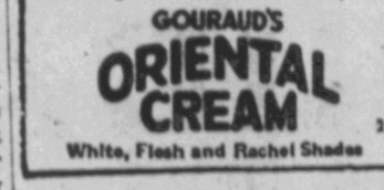
White, Flesh and Rachel Shades

Instantly Renders an irresistible, soft, pearly loveliness that will add years of youth to your appearance. The effect is so delicate and natural, the use of a toilet preparation cannot be detected. Lasts through the day without rubbing off, streaking or showing the effect of moisture.