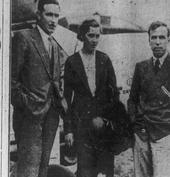
Capt. J. P. Saul (left), the Irish navigator for Kingsford-Smith on his Atlantic hop, and J. A. Mollison (right), British flier who flew from Australia to London in record time, are preparing to take off from London on a round-trip flight to New York. They are shown with Amy Johnson, Great Britain's premier aviatrix and Mollison's fiancée.