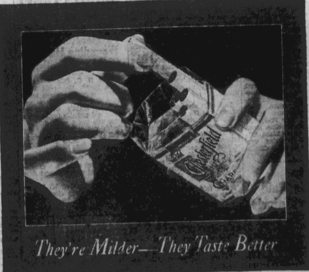
They're Milder—They Taste Better

As smokers become more experienced, they demand milder cigarettes. Chesterfields are milder. There is no argument about that. Their mildness is a feature as distinctive as their packaging or their trade mark. Their tobaccos are mild to begin with. Patient aging and curing make them milder still. Chesterfields contain just the right amount of Turkish—but not too much—carefully blended and cross-blended with ripe, sweet Domestic tobaccos. In this nerve-racking time, smokers—men and women—are showing a decided preference for milder cigarettes. Chesterfields are milder. They taste better. That's why "They Satisfy."