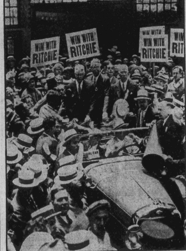
The arrival of Gov. Albert C. Ritchie of Maryland, one of the leading aspirants for the democratic nomination, touched off one of the first outbursts at the national convention in Chicago. Here is a view of the demonstration that greeted him.