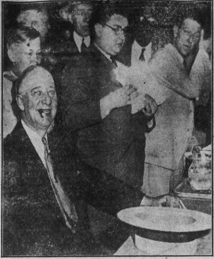
Alfred E. Smith, the "happy warrior" of four years ago, is back in the presidential race with the same fire and vigor that marked activities in 1928. Here he is in his Chicago headquarters surrounded by campaign workers as he planned his convention strategy.

ful effort to preserve the union of states.