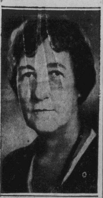
A recent picture of Mrs. Miriam A. Ferguson, first woman governor of Texas. She recently opened her fourth campaign in seven years for the gubernatorial office.