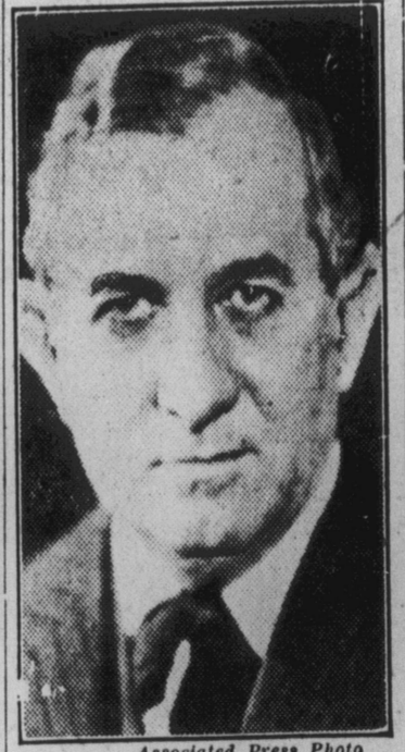
Senator John Connally (above) of Texas will place John N. Garner in nomination for the presidential candidacy at the Chicago convention.

Tonight At 8 O'clock In The Interest Of Sen. Cameron Morrison Candidacy For Re-election To The UNITED STATES SENATE Be Sure To Hear Her