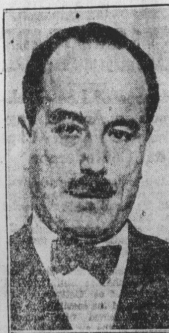
Carlos Davila (above), former Chilean ambassador to the United States, was reported leading a revolution in Santiago, Chile, which proclaimed a socialist republic.