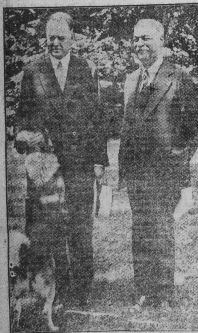
President Hoover and Vice President Curtis, again chosen to lead the republicans to the 1932 election, stand for this picture on the White House lawn, the first since they were re-nominated at the Chicago convention.