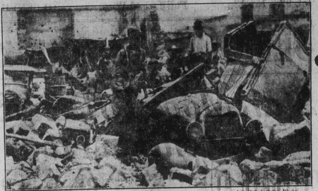
This picture made after recent earthquake in Mexico City shows the destruction left in its wake. More than three score persons were known to have been killed and upwards of 100 were injured. Much damage was done over a wide area and a number of smaller towns were destroyed.