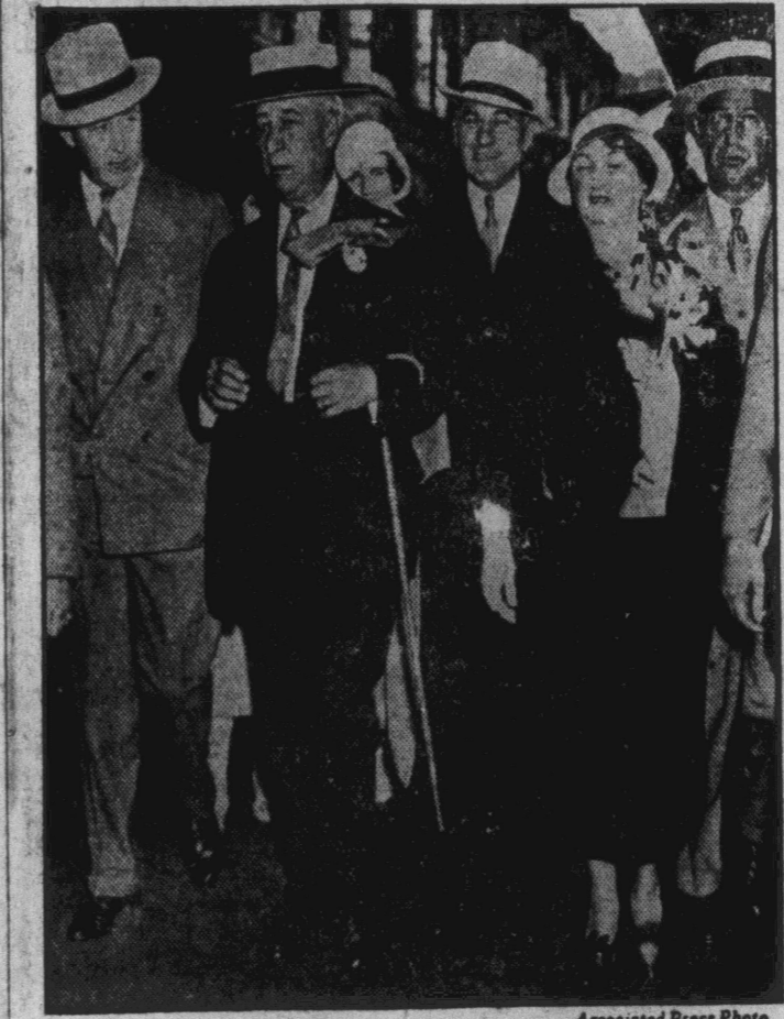
The "happy warrior" and defeated candidate in the 1928 campaign, Alfred E. Smith, was surrounded by a group of admirers when he and Mrs. Smith arrived in Chicago for conferences preliminary to the democratic convention.