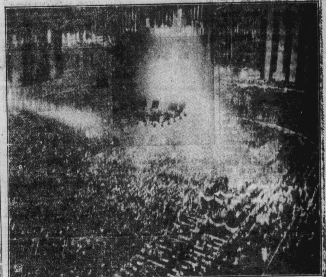
This Associated Press Telephoto shows the scene in the mammoth Chicago Stadium as Senator Simeon D. Fess, of Ohio, banged lustily with his gavel to call the Republican National Convention to order. The stadium was filled with delegates and visitors, while flags fluttered as the conclave began its session.