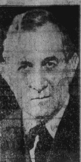
The speaker of the house will be placed in nomination for president at the democratic convention by Senator Tom Connally of Texas.

Insurance Company, dated November 26th, 1927, duly registered in Book P-16 at page 512 in the office of the Register of Deeds of Pitt County, N. C., default having been made in the payment of the indebtedness therein described, the undersigned will on