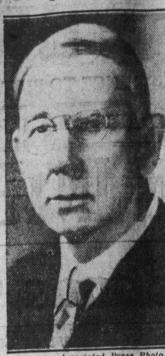
John N. Holder of Jefferson, former governor and widely known state politician, is a candidate for nomination for governor of Georgia in the democratic primary Sept. 14.