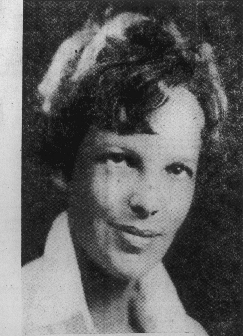
AMELIA EARHART, whose non-stop solo flight across the Atlantic in 15 hours and 50 minutes, broke all time records for trans-Atlantic crossings. She used "Standard" products—Stanavo Aviation Gasoline and Stanavo Aviation Engine Oil.