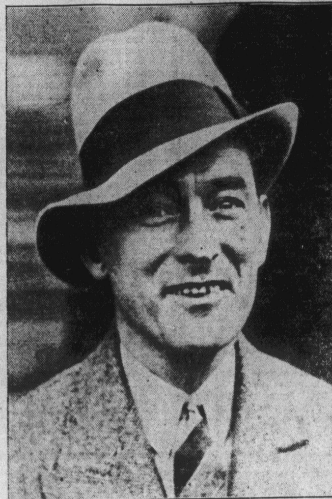
James J. Walker, dapper mayor of New York City, vigorously defended himself in the investigation which opened under direction of Samuel Seabury today.