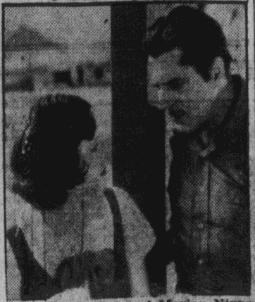
Warner Baxter and Marion Nixon in scene from "Amateur Daddy" at State Theatre Monday-Tuesday.

MONDAY 3:30 p. m.—Rehearsal for Children's Day at Eighth Street Christian Church. 3:30 p. m.—Woman's Auxiliary of St. Paul's Episcopal Church will meet.