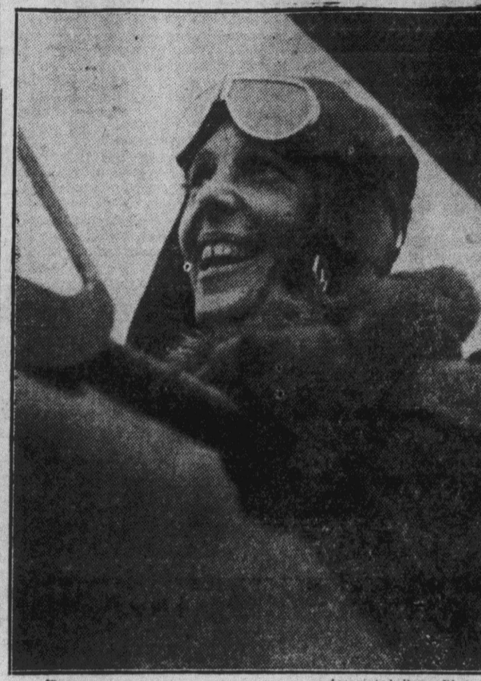
Mrs. Amelia Earhart Putnam landed her plane at Culmore, Ireland, this morning, when broken exhaust manifold and burned out gasoline gauge prevented her from completing her flight to Paris.