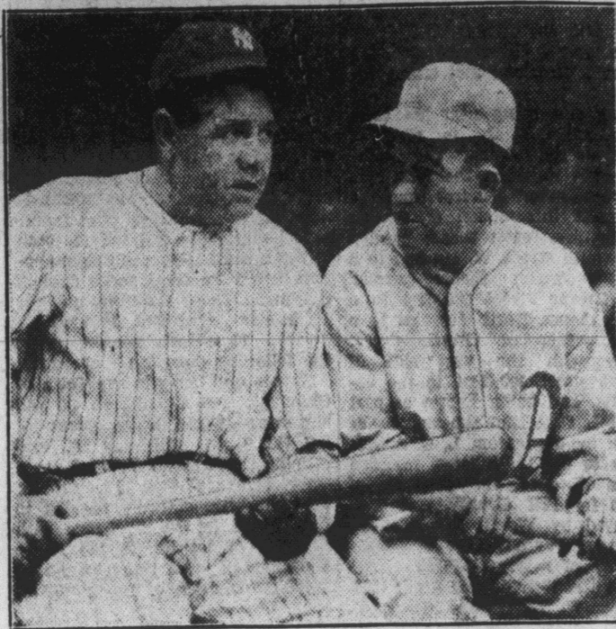
Babe Ruth (left), the Yankees' $75,000 worth of home run equipment, and Al Simmons, who does pretty well in the home run business for the Athletics, got together at the Yankee homecoming game in New York. The Babe banged out his fourth homer to contribute to the decisive defeat of the Mackmen. The score was 8 to 3.