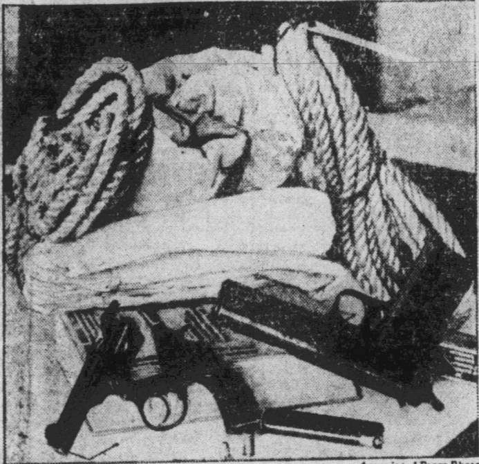
Some of the evidence introduced into the Honolulu slaying trial of Lieut. Thomas H. Massie and three co-defendants is shown here. It includes the sheet in which the body of the slain Joseph Kahahawai was wrapped, rope coiled around his body, the bullet and gun allegedly involved in the shooting.