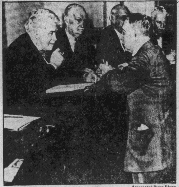
Charles G. Dawes (standing), head of the government's Reconstruction Finance Corporation, is shown as he argues against payment of soldiers' bonus certificates before the house of representatives ways and means committee. Rep. Henry T. Rainey of Illinois, Democratic leader in the house, is at left.