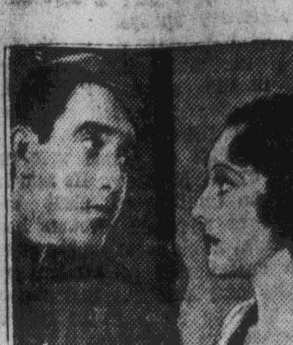
Above—Spencer Tracy, Ann Dvorak in "Sky Devils"