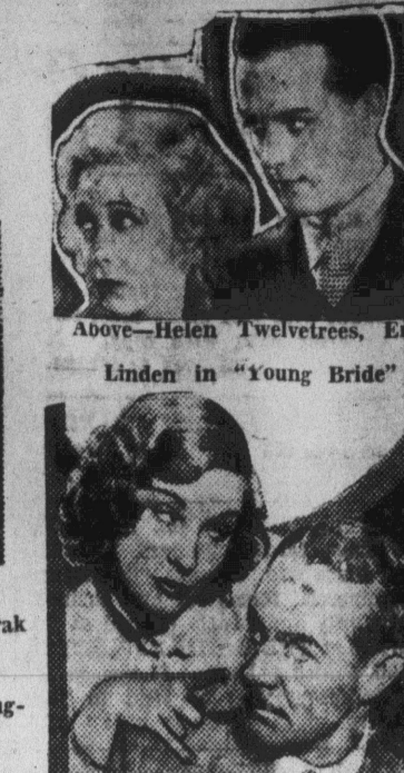
Above—Helen Twelvetrees, Eric Linden in "Young Bride"