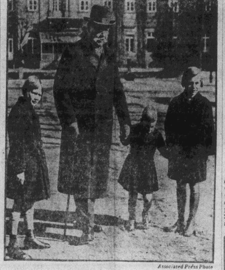
President Von Hindenburg was given over a 7,000,000 lead in the presidential election yesterday, but a runoff will be necessary to determine the race. Adolf Hitler's weakness was a surprising feature of the contest. Picture shows president and two grandchildren.