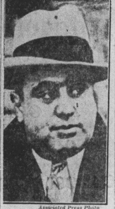
Gangster "Scarface Al" Capone, in jail in Chicago under sentence to 11 years imprisonment for failure to pay income taxes, said he was "pretty sure" he could get the Lindbergh baby back if he were released on bond.

Hopewell, N. J., March 14.—(AP)—Gangsters from Denver, Colo., who have gone east by airplane, are being watched by police in the hope that they may be able to shed some light on the kidnapping thirteen days ago of the Lindbergh baby.