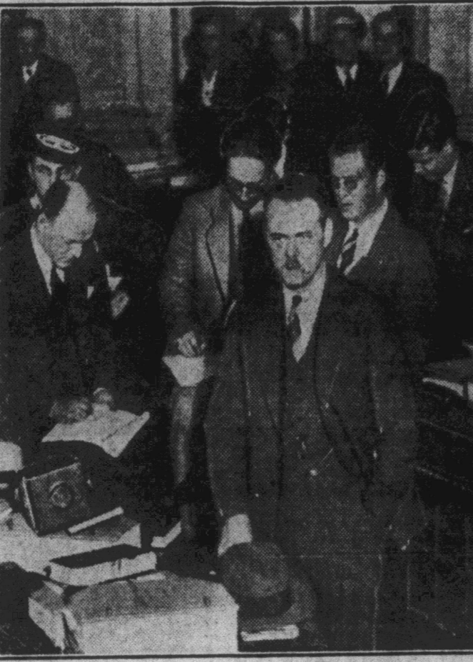
Col. H. Norman Schwartzkopf, head of the New Jersey state police who has directed the police investigation of the Lindbergh kidnaping, telling newspapermen about the case at the state house in Trenton, N. J.