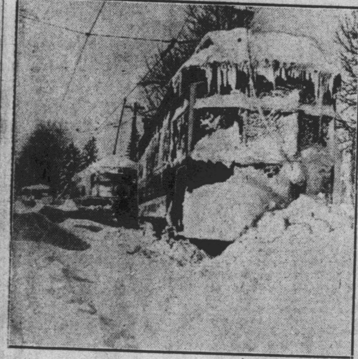
These trolley cars were marooned for more than 36 hours at Syracuse, N. Y., in a blizzard that was part of a general March storm that lashed the eastern seaboard. Drifts, which in places were many feet high, halted buses, trucks and other vehicles.