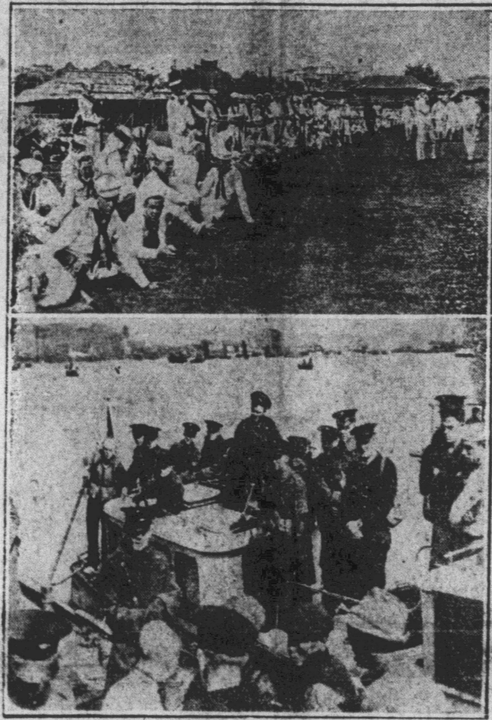
American troops in the area of Shanghai, scene of Sino-Japanese warfare, have been mobilized to protect Americans and American interests in that city. In these exclusive Associated Press pictures United States sailors (above) are shown on guard at the race track in Shanghai, and (below) a riot squad from a navy destroyer is shown landing at Shanghai.