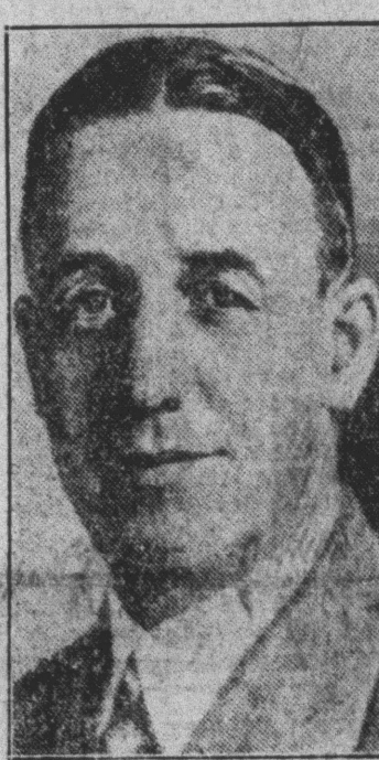
Paul Bester, commissioner of the federal farm board, was named an ex-officio member of the $2,000,000, 600 reconstruction finance corporation.