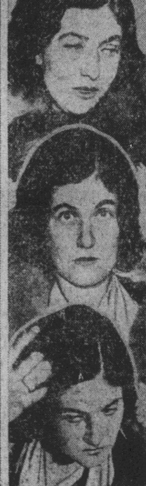
This study in moods and emotions is of Mrs. Winnie Ruth Judd, who is on trial for her life in Phoenix, Ariz., charged with the trunkslayings of two women friends.