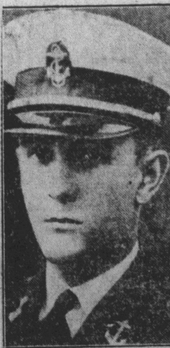
Here is a recent picture of Lieut. Thomas Massie who is held in Honolulu with Mrs. Granville Fortescue in the slaying of Joe Kaha-hawai, Hawaiian native who was charged with attacking Mrs. Massie.