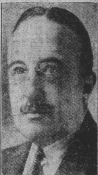
Andre Tardieu, minister of war, heads the French delegation to the Geneva disarmament conference.