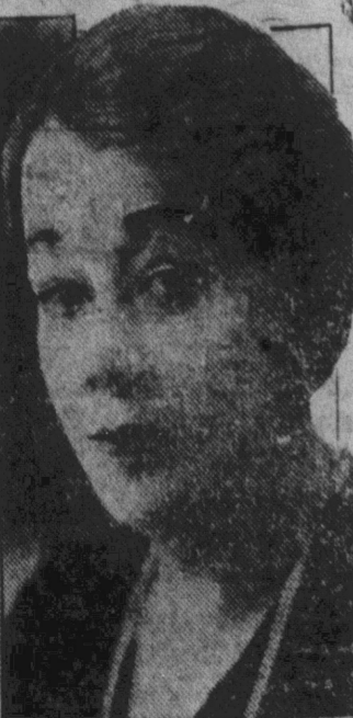
Pauline Lord, who retired from the theater when she was married two years ago, has returned to Broadway. She is the star of "Distant Drums."