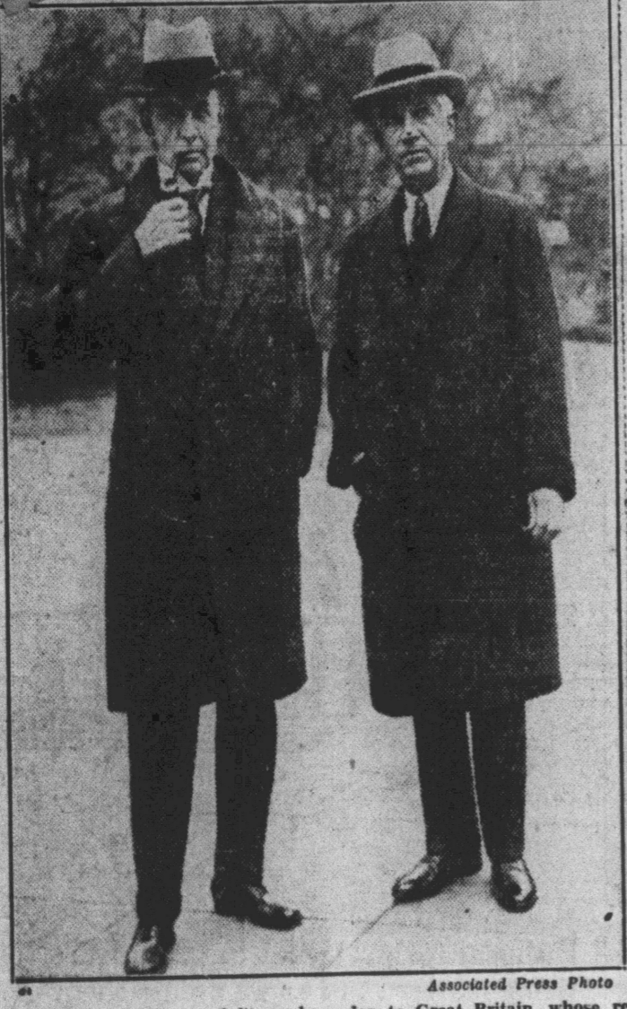
Charles G. Dawes (left), ambassador to Great Britain, whose resignation has caused political Washington much speculation in the face of the forthcoming presidential election. Picture shows Dawes and Norman H. Davis following a conference with President Hoover at the White House.