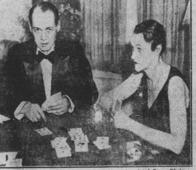
Mr. and Mrs. Ely Culbertson, who won over Sidney Lenz in the 150-rubber test of rival bidding systems at New York. Play ended last night with the Culbertsons 8,980 points in the lead.