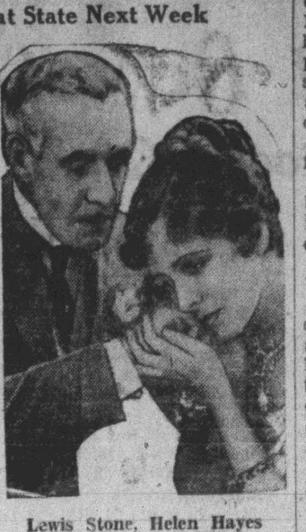
Lewis Stone, Helen Hayes "Sin of Madelon Claudet"