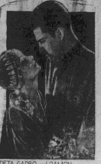
GRETA GARBO and RAMON NOVARRO in "MATA HARI"