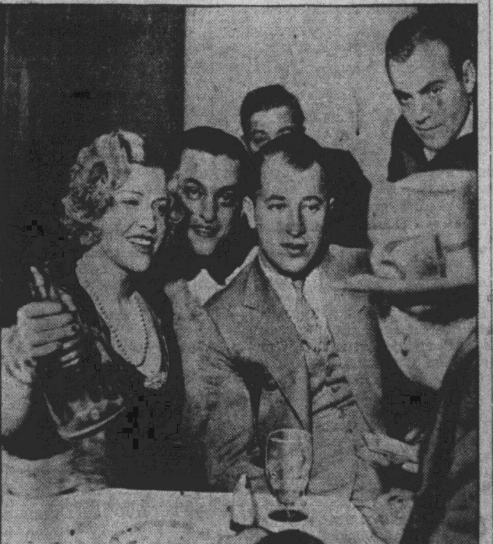
Dry agents raided Texas Guinan's Chicago night club a few hours before a rollicking New Year's celebration was to have taken place, and stripped the place of its furnishings. Here the Broadway night club hostess is shown as she shouted, "Here's a bottle you forgot," to the raiders.