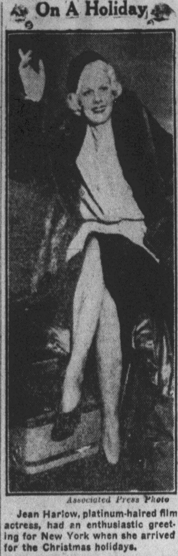
Jean Harlow, platinum-haired film actress, had an enthusiastic greeting for New York when she arrived for the Christmas holidays.

Washington, Jan. 1. (AP)—Four early birds who braved a pouring rain to stand long before daybreak at the White House gate, were rewarded today with a breakfast invitation from President Hoover.