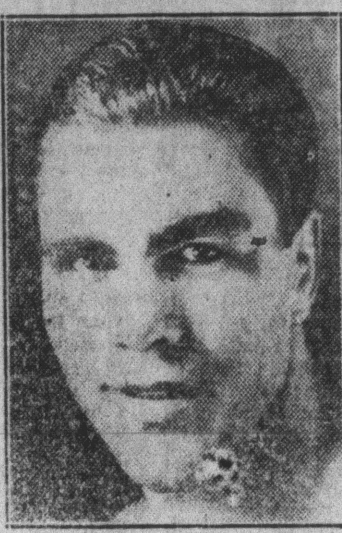
Max Schmeling (right) of Germany will defend his heavyweight championship against Mickey Walker of Rumson, N. J., in a 15-round bout at Miami, Fla., late in February.