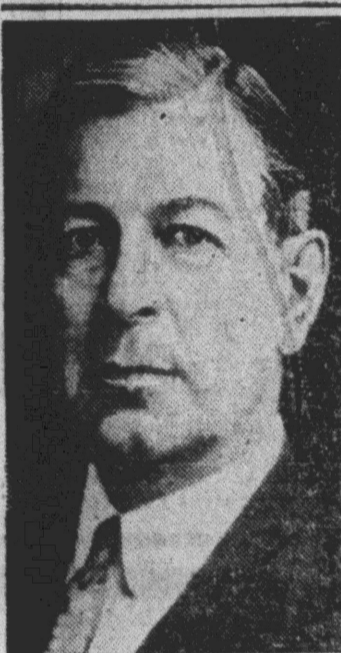
It has been rumored that Dwight F. Davis may resign his post as governor-general of the Philippine Islands because of his wife's illness.