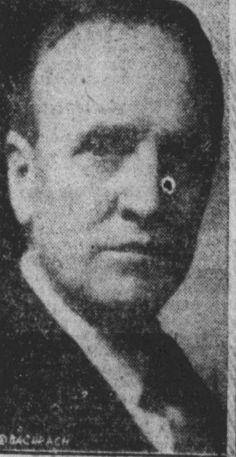
Senator Henry F. Ashurst of Arizona described attempts to change the prohibition laws "a ridiculous waste of effort" and withdrew from a senate judiciary sub-committee named to hold hearings on the subject.