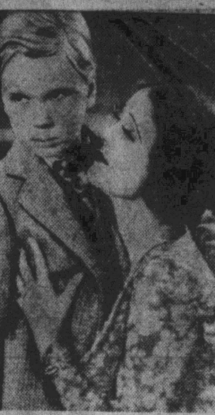
JACKIE COOPER and IRENE RICH in the Champ