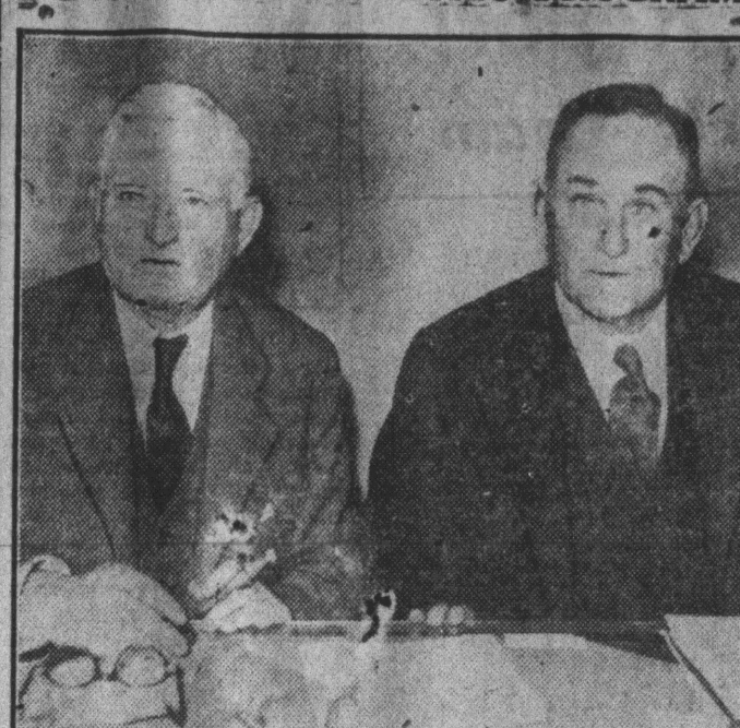
The democratic speaker of the house, John N. Garner (left), and Joseph T. Robinson, democratic senate leader, shown as they got together in Washington to map the democratic legislative plans.