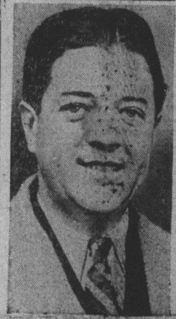
Senator Robert M. LaFollette Jr. of Wisconsin has introduced a bill for a $5,500,000,000 of "prosperity bonds" for immediate expansion of federal, state and local building projects.