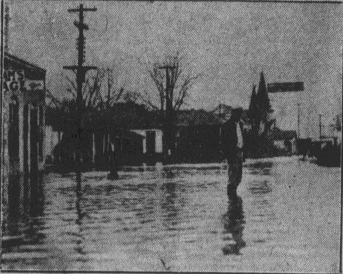
Rivers swollen by heavy rains overflowed their banks making hundreds homeless and causing widespread destruction in the lower Mississippi valley. Above is a big dairy farm near Swan Lake, Miss., isolated by flood waters from the Tallahatchie river. A street in Webb, Miss., is shown below. Residences and buildings are half submerged by water from the Tallahatchie river.