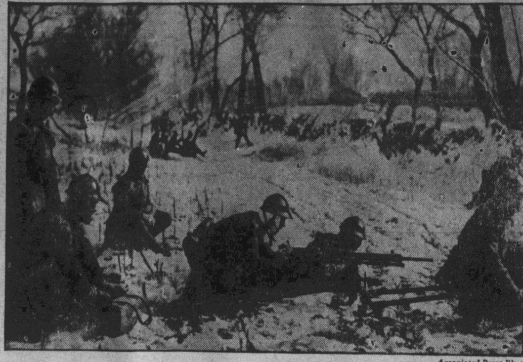
Winter has overtaken the warring forces of Japan and China, but the fighting in Manchuria continues, as is shown in this unusual picture of Japanese infantry machine gunners in action at Manchuria, southwest of Mukden.