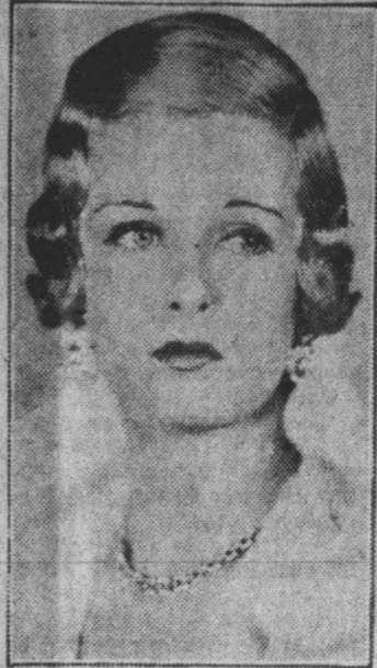
The engagement of Joan Bennett (above), motion picture actress, to Gene Markey, author and scenarist, has been formally announced, and Hollywood expects the wedding soon.