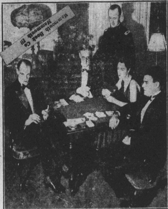
Here is the start of the Ely Culbertson and Sidney S. Lenz bridge tilt in New York. The contest is to extend through 150 rubbers to decide which of their respective systems is supreme. Culbertson posted $5,000 against Lenz's $1,000, the winnings to go to charity. Culbertson is paired with his wife and Oswald Jacoby is Lenz's partner. Left to right: Culbertson, Lenz, Mrs. Culbertson and Jacoby. Lieut. Alfred M. Gruenther, referee, is standing.