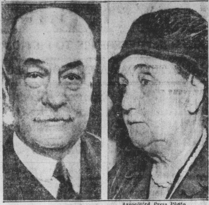
The Nobel peace prize for 1931 was awarded to Dr. Nicholas Murray Butler, president of Columbia University, and Jane Addams, Chicago social worker. Each will receive one-half of the amount of the prize which in recent years has been about $40,000.

You didn't say so, but you meant you'd see me again. Now didn't you?" "Honest?" "Miss Preston, I—I certainly did," answered Rock hastily. "But, indeed, I didn't mean to be rude or—or bold." "I don't think you were, either," she said earnestly. "I—But wait a moment. My sister is coming." Rock glanced up to see the slim figure of Alice pass by toward the cabin. "Good night, Mr. Cowboy," she said, naively. "Good night, Miss Preston," replied Rock, trying to be gay. She went into the cabin and closed the door. Soon a light gleamed pale through a curtained window. "We might sit down," suggested Thiry, indicating a rustic bench under the pine. "I am tired." The bench appeared to catch a gleam of shadowed moonlight. She could be seen here more clearly than when she stood in the shade. Rock preferred to stand, and he wished he could not see her so well. "Mr. Rock, please don't misunderstand," she began, looking up. "I was far from being insulted or even offended that day in the store and at the corral. . . . At the last, there you meant you'd see me again. And you've done it. Now we're concerned with that." "Reckon I might have waited a decent little while," responded Rock as she paused. "But I never met a girl like you. I wanted to see you again—soon. Where's the harm?" "Indeed there isn't any harm in