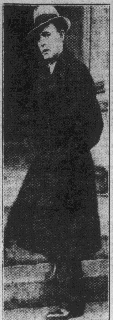
Jack "Legs" Diamond, New York gangster, who divides his time between hospitals and courtrooms, is in a trial in Troy, N. Y., charged with kidnaping a truckman.