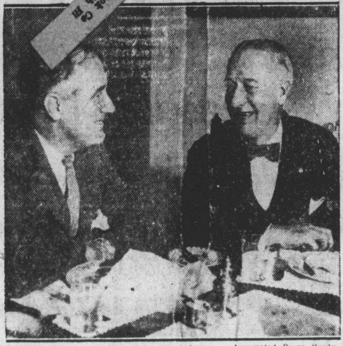
Gov. Franklin D. Roosevelt (left) of New York and Alfred E. Smith, two leaders of the democratic party, photographed together at a luncheon conference in New York. No hint of their recent widely publicized disagreement over state reforestation was evident nor did either comment after the luncheon. The meeting excited a number of possibilities in view of the approaching democratic presidential campaign.