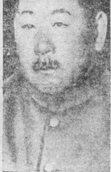
Gen. Goro Minami (above), minister of war, explained Japan's position in Manchuria to Emperor Hirohito. After a hard fought battle with Chinese troops the war office announced that "positive and effective" measures would be undertaken to cope with the situation.