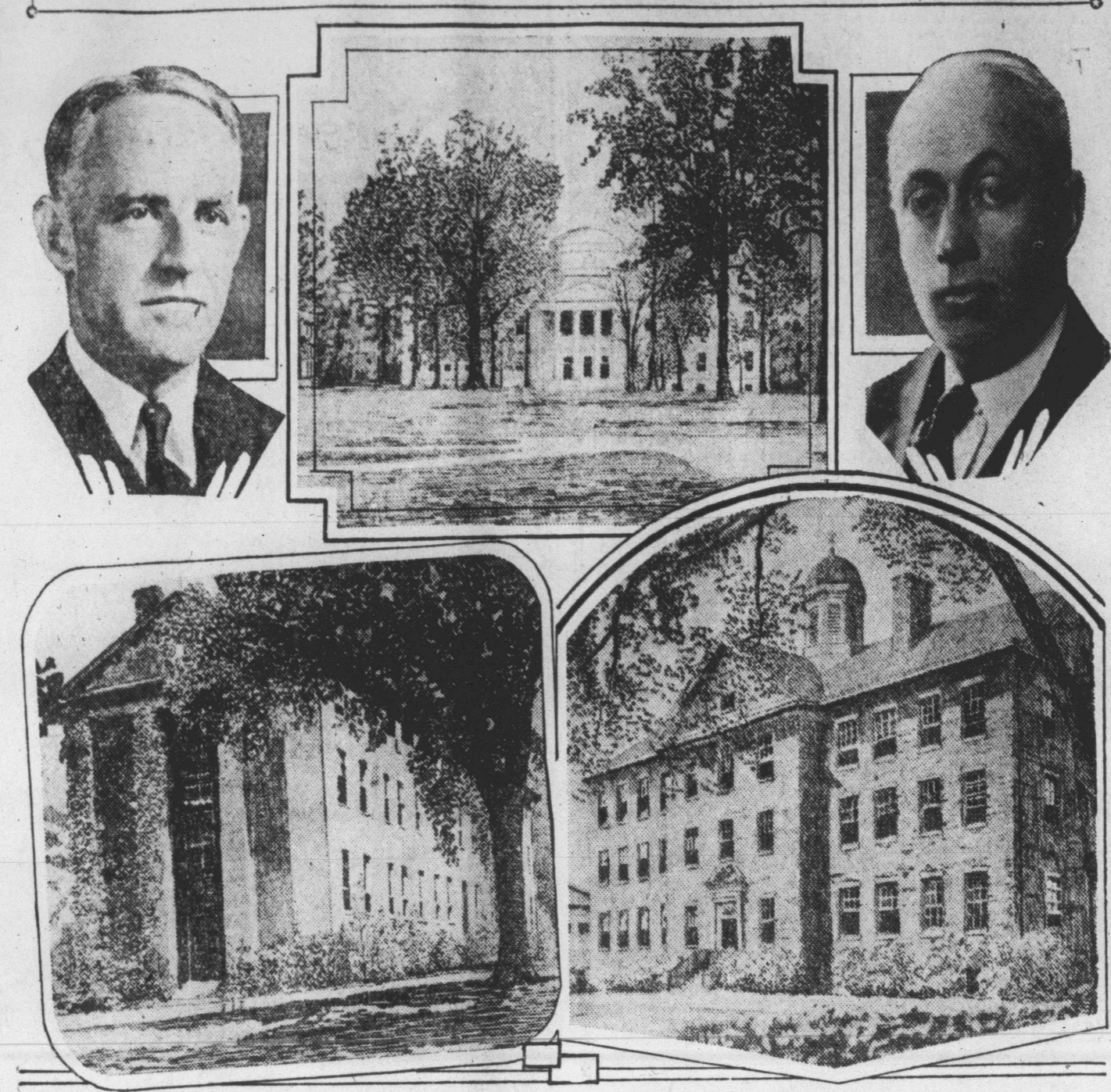
Chapel Hill, Nov. 9.—Above are two of the principal figures in the inauguration of Dr. Frank Porter Graham as eleventh president of the University of North Carolina and some scenes representing the old and the new on the university campus.

Top center: The university's new library, which, with more than 200,000 volumes, houses the largest college book collection in the south, this side of Texas. The library is the central feature of the new development known as the South campus.