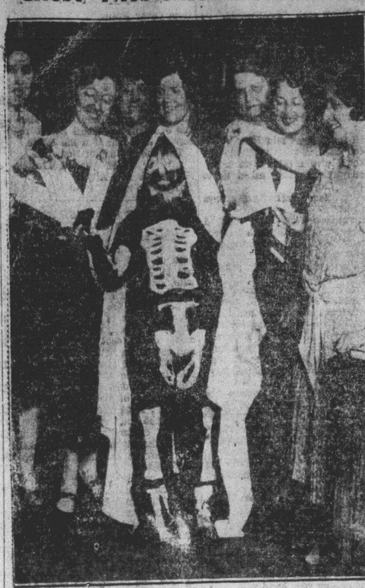
Cheer came to thousands of Chicago school teachers when they received their pay checks for the first time in six months. To celebrate the occasion teachers at the Victor F. Lawson school, shown above, had a "ghost" to hand out the welcome checks.