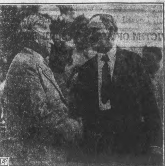
Ex-Governor McRae, of Arkansas, who delivered an address of welcome to Senator Joseph T. Robinson when the latter visited Little Rock, tells the Democratic vice-presidential nominee that he is first in the hearts of his fellow Arkansans.