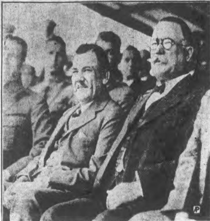
This recent picture of Alvaro Obregon, assassinated president-elect of Mexico, was taken at a feast in his honor at Celaya during his campaign for the presidency. At the left is President Plutarco Calles.