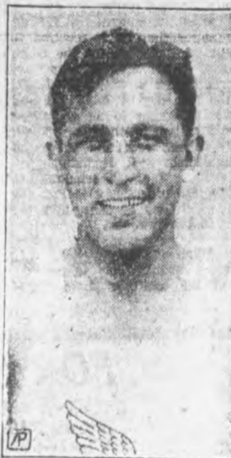
Ed Hamm, Georgia Tech's famous broad jumper leaped to a new world's record of 25 feet 11 1/2 inches in his Olympic trials at Cambridge, Mass.