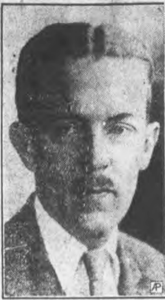
S. Pinckney Tuck, former envoy at Geneva, is the new United States consul at Constantinople.