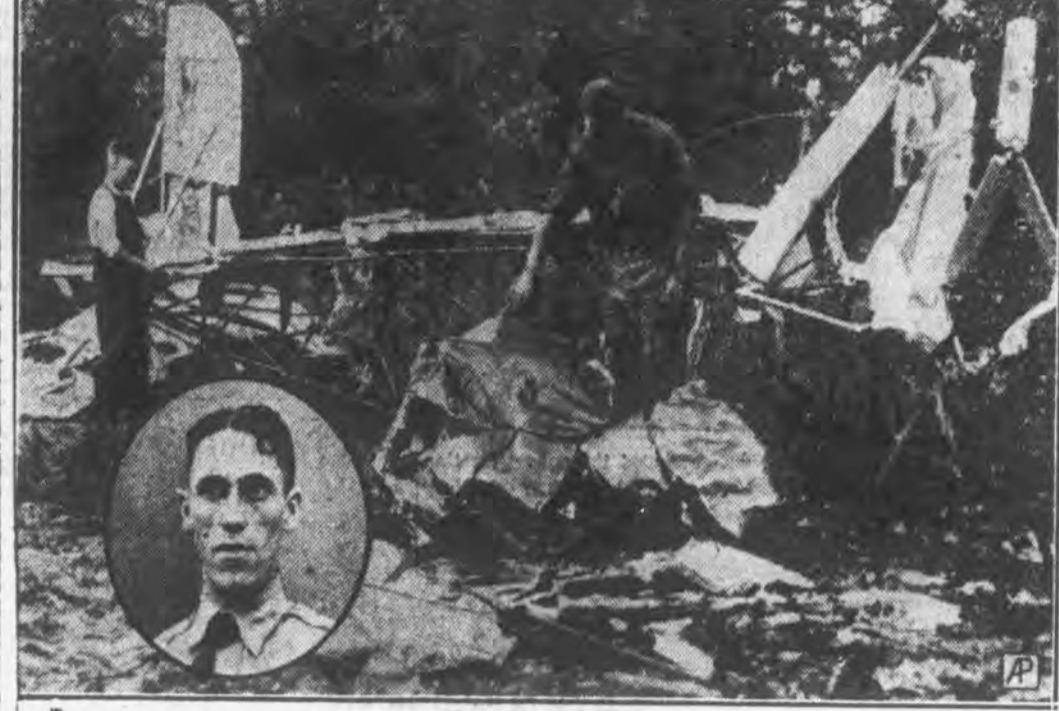
Capt. Emilio Carranza, Mexico's air hero, was killed when his plane crashed during a storm in a secluded section of New Jersey soon after his take off on an attempted New York-to-Mexico City nonstop flight. Picture shows the battered fuselage and part of the wreckage, which was strewn for a quarter of a mile.