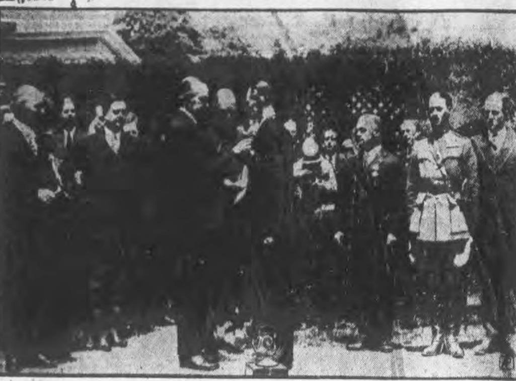
After an enthusiastic greeting in Washington, the three German-Irish comrades of the trans-Atlantic Bremen received the distinguished flying cross from President Coolidge at the White House. In honoring Capt. Koehl the president conferred the first former enemy decoration upon a German since the war.

tell God you are an hell-bounder sinner and you are so close to the pit that you can smell the sulphur fumes as they vomit from the funnel, and God will snatch you from the brink, and then you will become a man after God's heart. If you are man enough tell God that you are an old sinner and that you want to go square with Him and that is why David was a man after God's heart; not because he sinned, but when he sinned he was man enough to tell God he was a sinner and so you will become a man after God's heart when you do that."