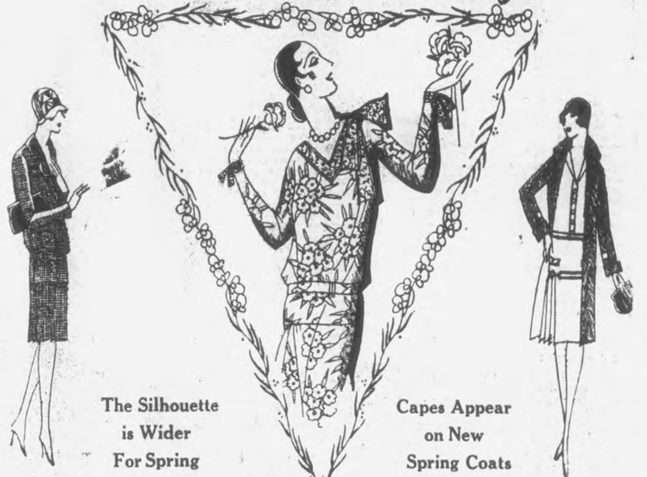
The Silhouette is Wider For Spring