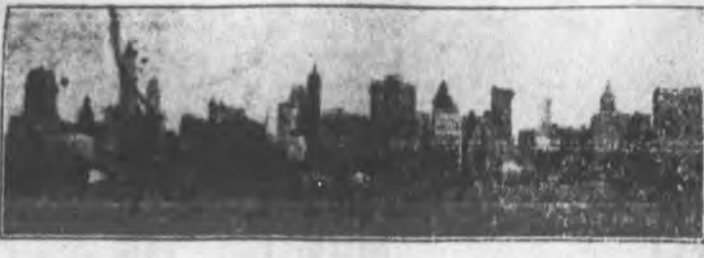
Above is the skyline of New York as viewed from the Hudson River. This is one of the sights that will be seen by those who take one of the Reflector Vacation Tours this summer.

autonomous development. We may not now hope that the pledge to the Armenians made in 1918 will be kept, but at least Christians in America may keep alive American sympathy by feeding and educating orphans."