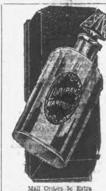
Mail Orders 5c Extra

IF YOU HAVE KNOWLEDGE OF SEWING we will teach you designing, dress making and tailoring. We also guarantee you a position that will pay you not less than $20.00 or $25.00 a week. For full particulars or personal interview, write to P. O. BOX 676 Greenville, N. C.