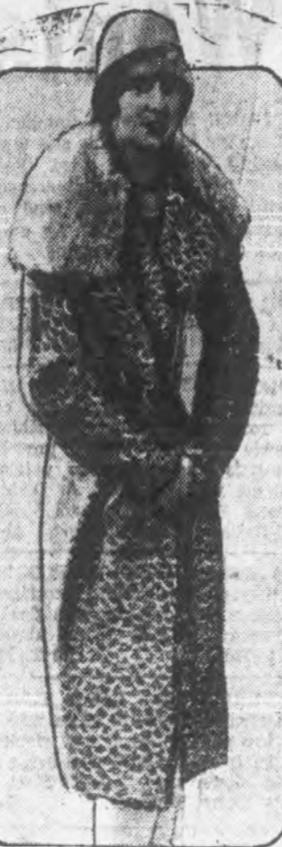
PRINCESS ILEANA OF RUMANIA

under the tutelage of a well-known Rumanian sculptor and artist, who encouraged her to adopt sculpturing as a vocation. Since her father's death she has given almost all her time to this art and to painting especially water-color work.