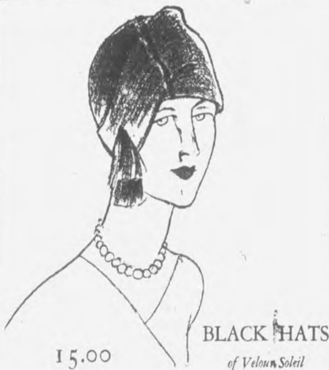
BLACK HATS of Velour Soleil

NATIONAL BISCUIT COMPANY "Uneeda Bakers"