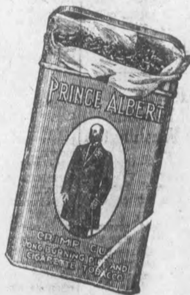
P. A. is sold everywhere in tidy red tins, pound and half-pound tin humidors, and pound crystal glass humidors with sponge-moistener top. And always with every bit of bite and punch removed by the Prince Albert process.

No matter how set you appear to be on a smoke-program, try P.A. I give you my word, no other tobacco that ever came down the pike ever brought so much downright satisfaction out of a pipe. "That fellow knew his groceries," you'll say, or words to that effect.