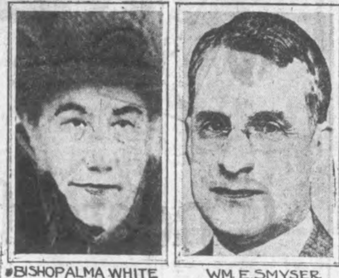
BISHOP ALMA WHITE