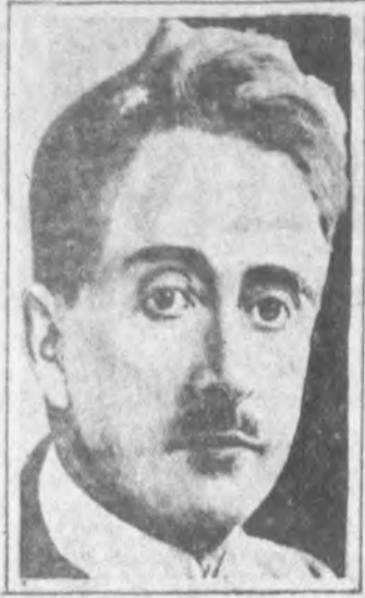
WILLIAM T. COSGRAVE