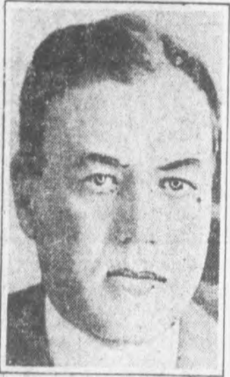
HAMILTON FISH JR.