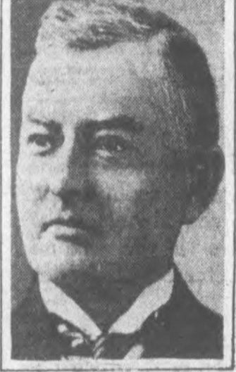
JOHN T. GARNER