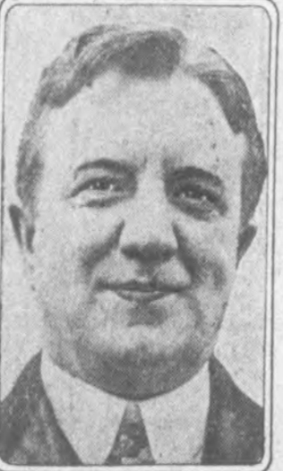
SEN CLARENCE DILL