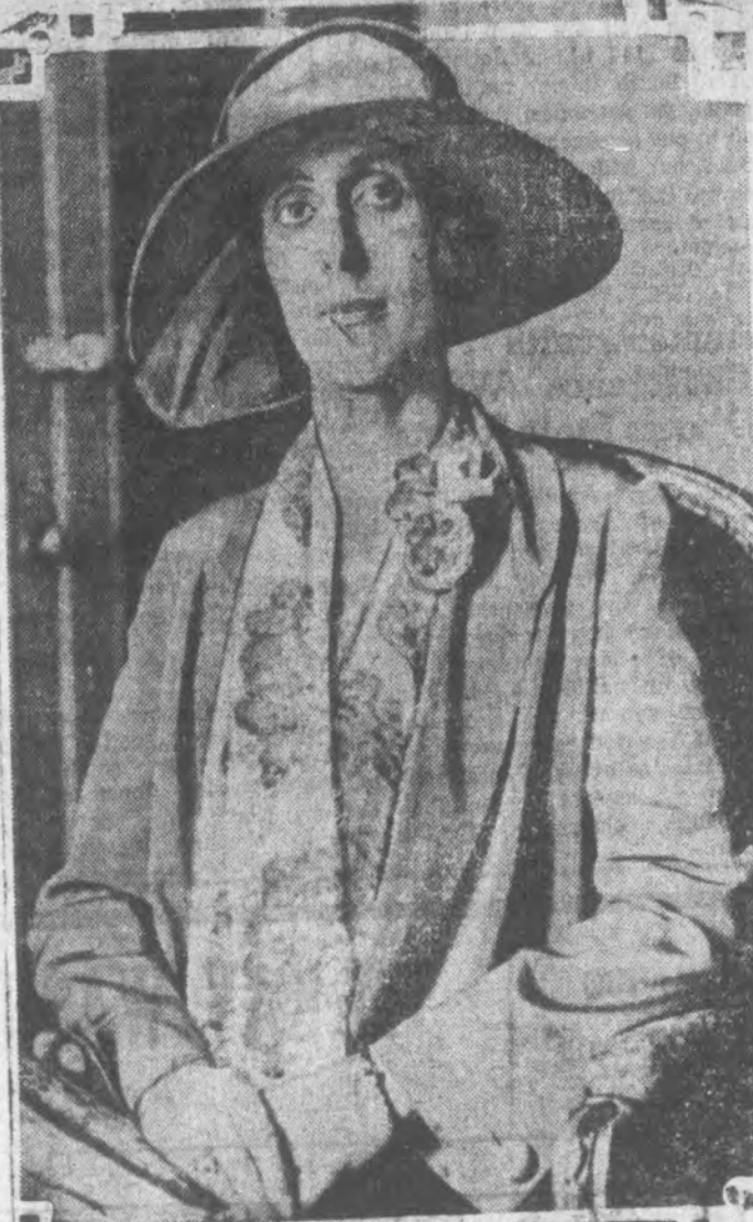
Crown Princess Louise of Sweden, giving her views of this and that for the press, said there is something about silk stockings made here "that is simply wonderful." She is fond of gardening and plays "a little bad tennis."

American cooking? The Prin- cess likes it. "I like your hot rolls and lob- ster. All your food is splendi- d." "Of course I found charming— the Americans who have entertain- ed me." The Princess laughed at the question someone asked, as if she could not or would not say other-