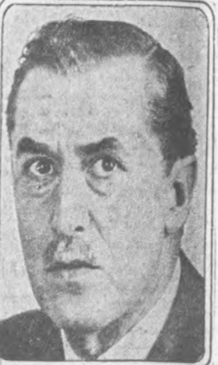
E. T. MEREDITH