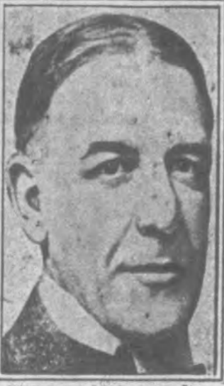
EDWARD W. BOK

Evangeline Booth was seriously ill at Scarsdale, N. Y. J. C. Walton may run for Lieutenant-Governor of Oklahoma, presiding over the Senate which impeached him. Senator Walter E. Edge demanded Congress authorize a national prohibition referendum. Princeton University has accepted a gift of $150,000 for a Woodrow Wilson chair of literature from Edward Bok.