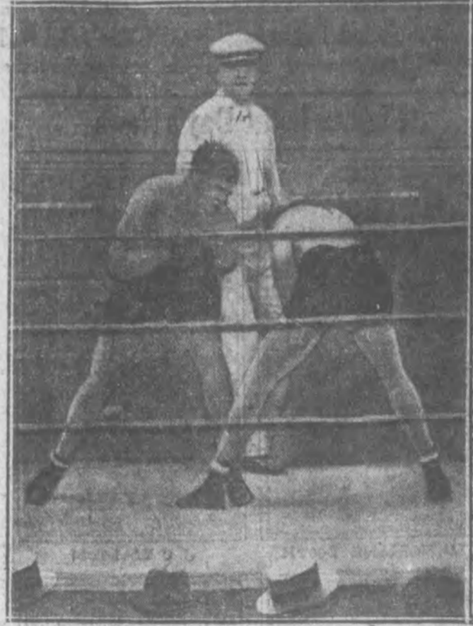
This picture was taken when Pete Latzo (left) had the upper hand on Mickey Walker (right) in the fight for the welter weight championship at Scranton, Pa. Latzo won the decision in ten rounds.

Uncle Joe Cannon was always a remarkable character. On his ninetieth birthday he absolutely refused to give any advice to anyone.—Nashville Banner.