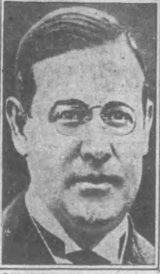
SEN WALTER E. EDGE