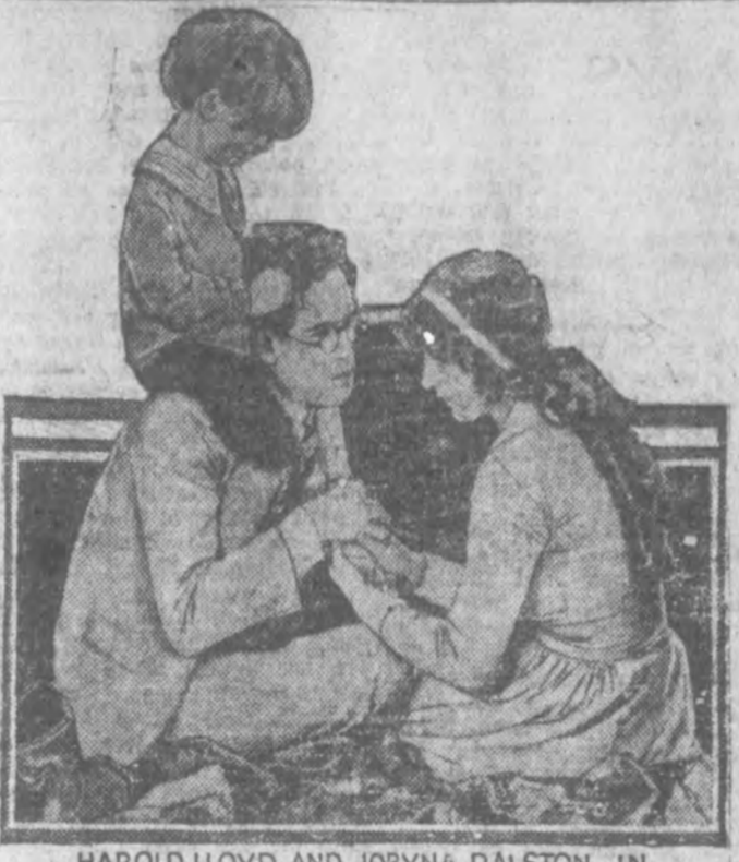
HAROLD LLOYD AND JOBYNA RALSTON IN "FOR HEAVEN'S SAKE" PRODUCED BY THE HAROLD LLOYD CORPORATION A PARAMOUNT RELEASE