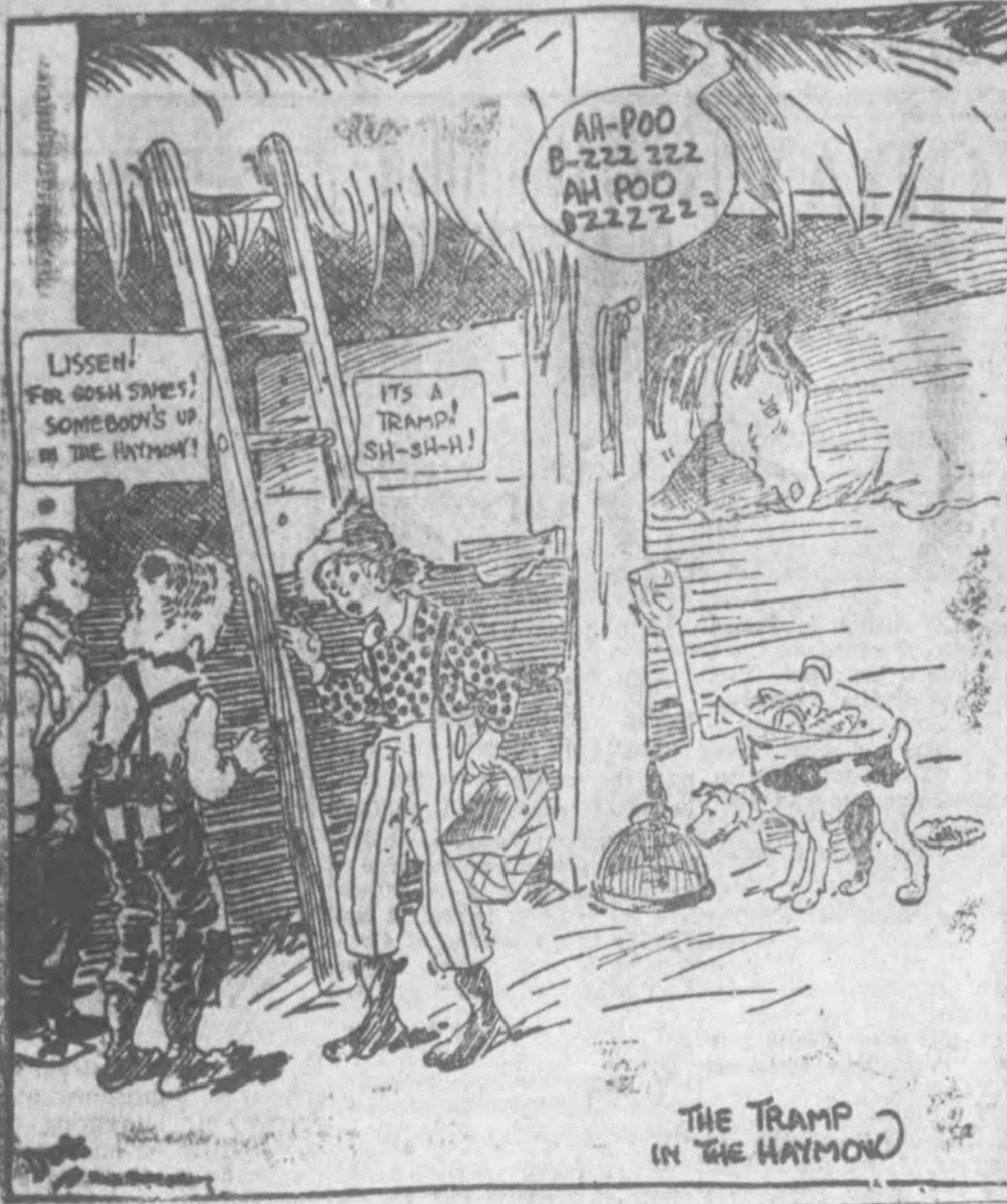
THE TRAMP IN THE HAYMOW