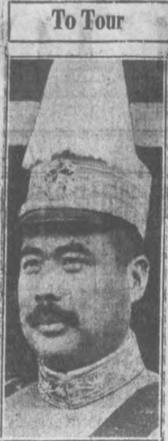
Marshal Feng Yu-Hsiang, who resigned command of 100,000 troops, will study conditions in Russia, Germany, France and Sweden before returning to China.

To Whom It May Concern: Greenville Cotton Mills, Incorporated, a Corporation duly created, organized and existing under and by virtue of the laws of the State of North Carolina, doth hereby certify that pursuant to resolutions duly and regularly passed and adopted by its Di-