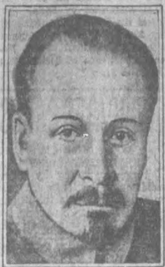
GEN. JOSEPH HALLER