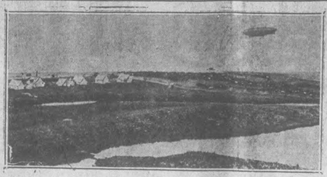
In this view of Teller, Alaska, the artist has inset a picture of the Norge, showing how Amundsen's Polar dirigible possibly appeared as it came to the end of its journey across the Pole.