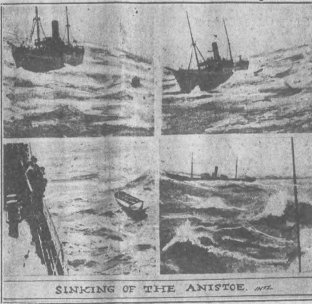
SINKING OF THE ANISTOE.

Motion pictures tell the tragic fate of the Anistoe, British freighter, which fell prey to a terrific Atlantic storm. An International Newsreel movie man, aboard the S. S. Roosevelt, obtained pictures of the sinking of the Anistoe and rescue of its crew by the Roosevelt. Above at left, the Anistoe when the Roosevelt hove to, to aid. Below, first lifeboat launched by the Roosevelt which overturned, drowning two of its men. Right above, the Anistoe listing badly; below, just before the freighter disappeared, only its rigging is above water.