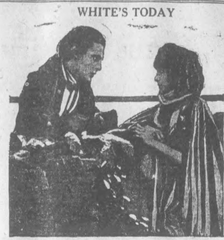
NEIL HAMILTON and CAROL DEMPSTER in D.W. GRIFFITH'S "AMERICA"