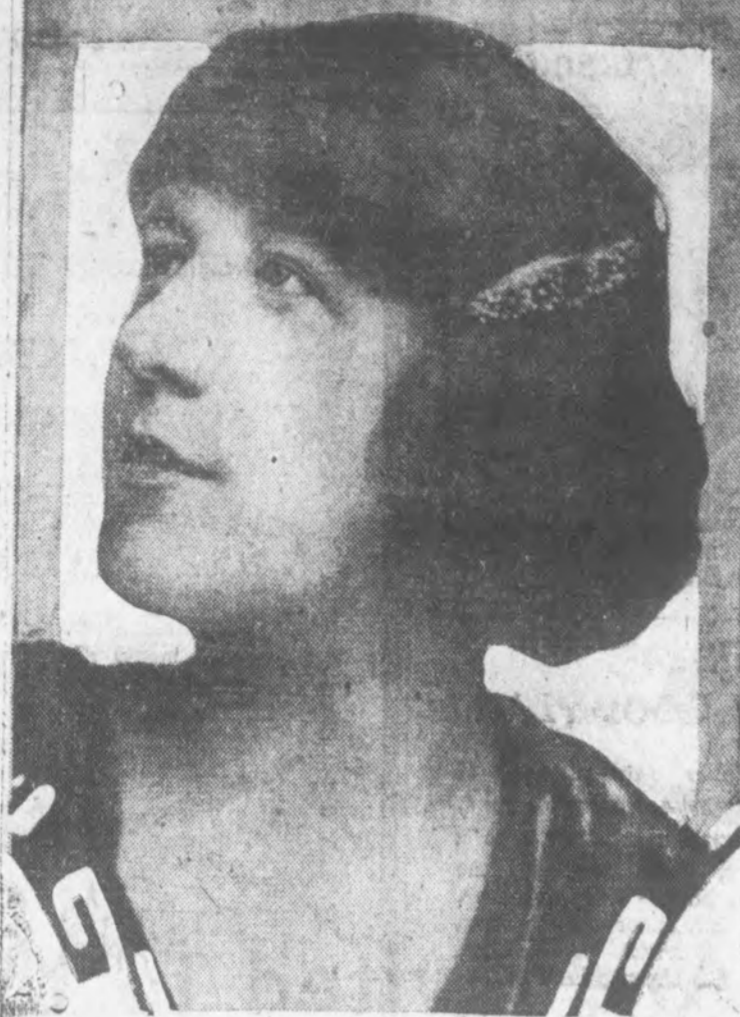
MRS. FRANZ MOLNAR.

The beautiful actress, Sari Fedak, wife of the Hungarian playwright, Franz Molnar, is fighting his suit for divorce in which he names forty-two correspondents.