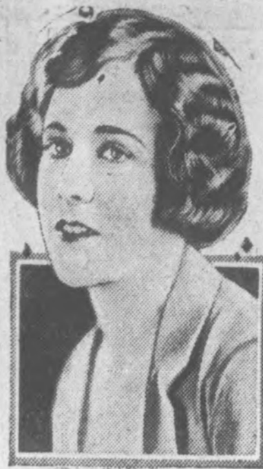
Virginia Valli "In Every Woman's Life"