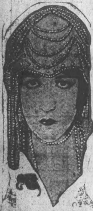
Aileen Pringle in "A Thief in Paradise"

Leipzig.—For the first time since the founding of the Gewandhaus con- certs in 1781 a visiting orchestra, the Saxonian State, will be included in the season's program. The extra- ordinary duties imposed upon the Gewandhaus orchestra by the recon- struction of the Leipzig municipal opera has caused the city council to curtail the concerts.