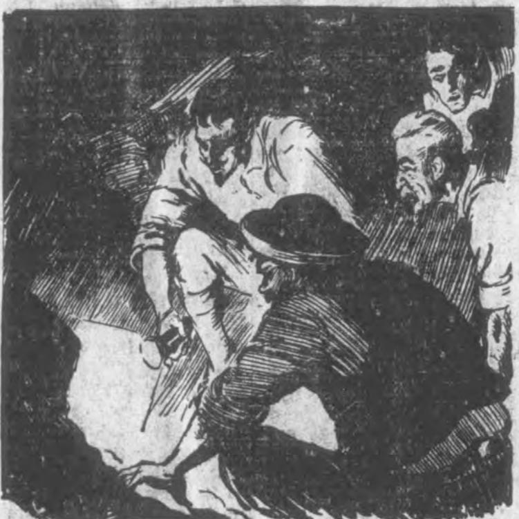
Suddenly an exclamation broke from Lord Rexton. "It's blocked," said he.

the sign of the arrow. Here was the point, and this the means by which Maple White and his ill-fated comrade had made their ascent.