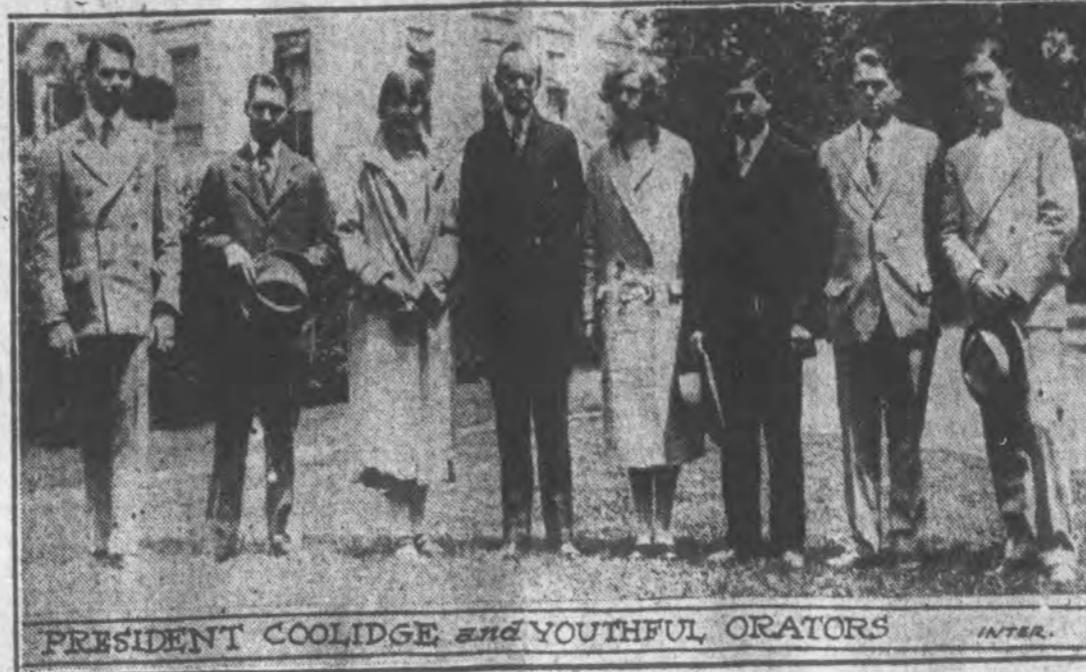
PRESIDENT COOLIDGE and YOUTHFUL ORATORS