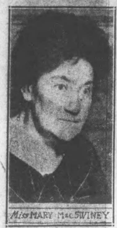
Miss MARY MACSWINEY

A hunger strike, similar to this from which her brother, Terence died, was threatened by Miss Mary MacSwiney in Chicago, when Federal officials led her to believe she might be arrested for coming into the country without a passport. She was on a patriotic mission for her cause. FLATULENCE those distressing pains caused by gases in the stomach and intestines, often aggravated by liver disorders and constipation, relieved and the tendency overcome by Chamberlain's Tablets For bodily comfort, ease of digestion, an active liver, a clean colon, sweet breath, and the regular daily movement so necessary to good health, take them to-night. * 25 cents at all drug stores.